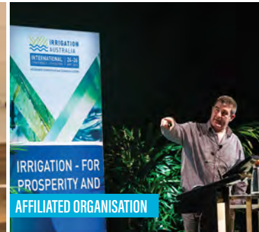
IRRIGATION - FOR PROSPERITY AND AFFILIATED ORGANISATION