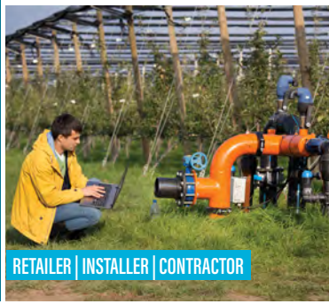
RETAILER | INSTALLER | CONTRACTOR