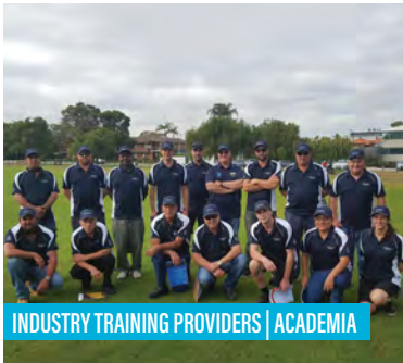
INDUSTRY TRAINING PROVIDERS | ACADEMIA