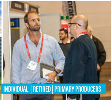
INDIVIDUAL | RETIRED | PRIMARY PRODUCERS