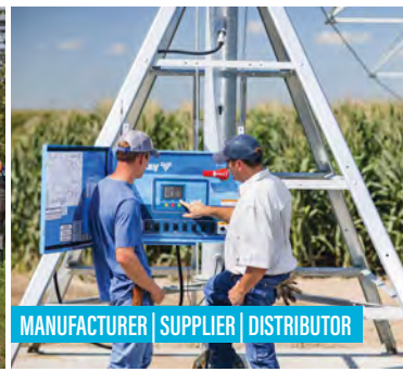
MANUFACTURER | SUPPLIER | DISTRIBUTOR